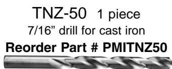
TNZ-50 1 piece 7/16" drill for cast iron Reorder Part # PMITNZ50