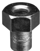
TNZ-8-28 12 pieces 8mm-1.25 extended barrel shoulder nut Reorder Part # PMITNZ8