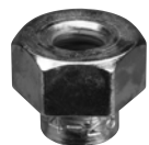
TNZ-4-28 14 pieces 8mm-1.25 large head shoulder nut Reorder Part # PMITNZ4